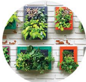
ADD COLOUR AND PERSONALITY WITH A VERTICAL GARDEN

Designing an outdoor space doesn't have to be overwhelming. Focus on what you enjoy, and you'll be enjoying your new, improved courtyard in no time.